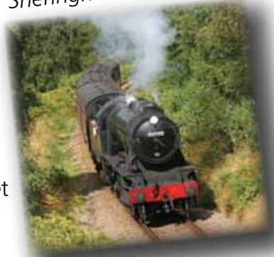
Sheringham Steam Train