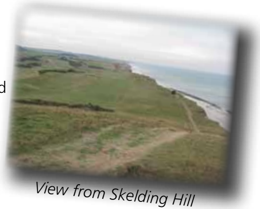
View from Skelding Hill